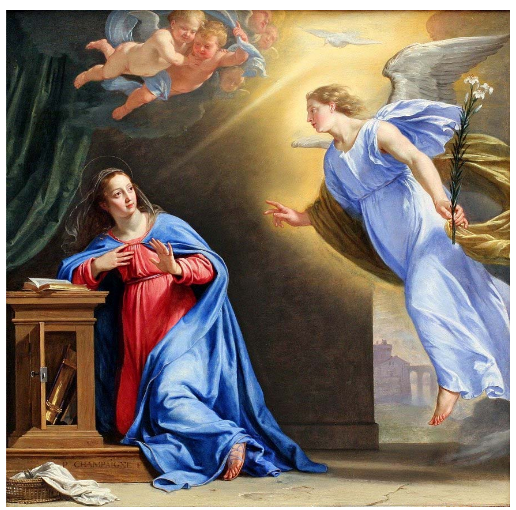
"The Annunciation" by Phillippe de Champaigne, c. 1642

≈ Keeping the heart of the University listening to the heart of God ≪