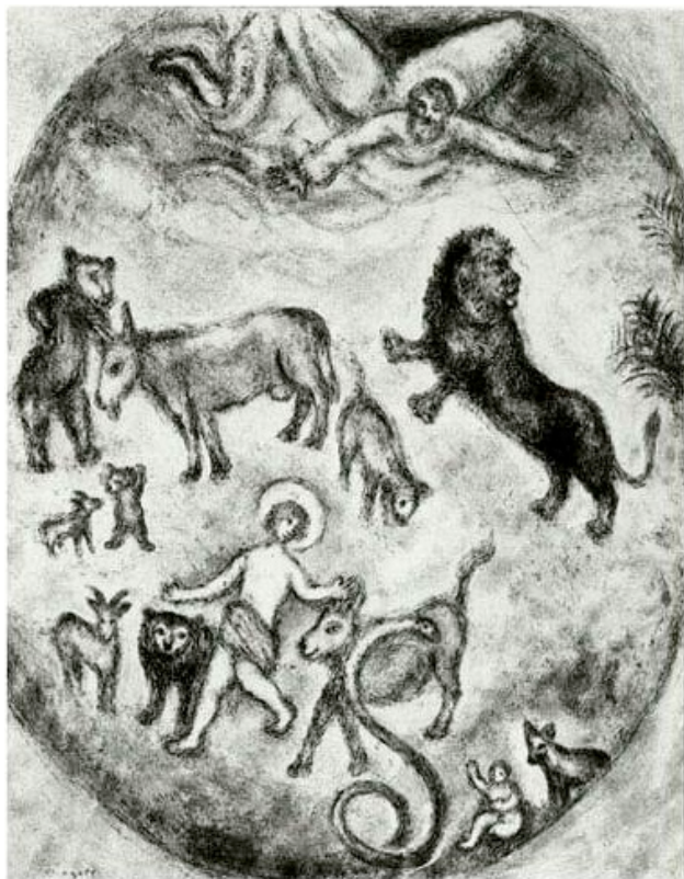
"Messianic Times," by Marc Chagall, 1952.

∞ Keeping the heart of the University listening to the heart of God ∞