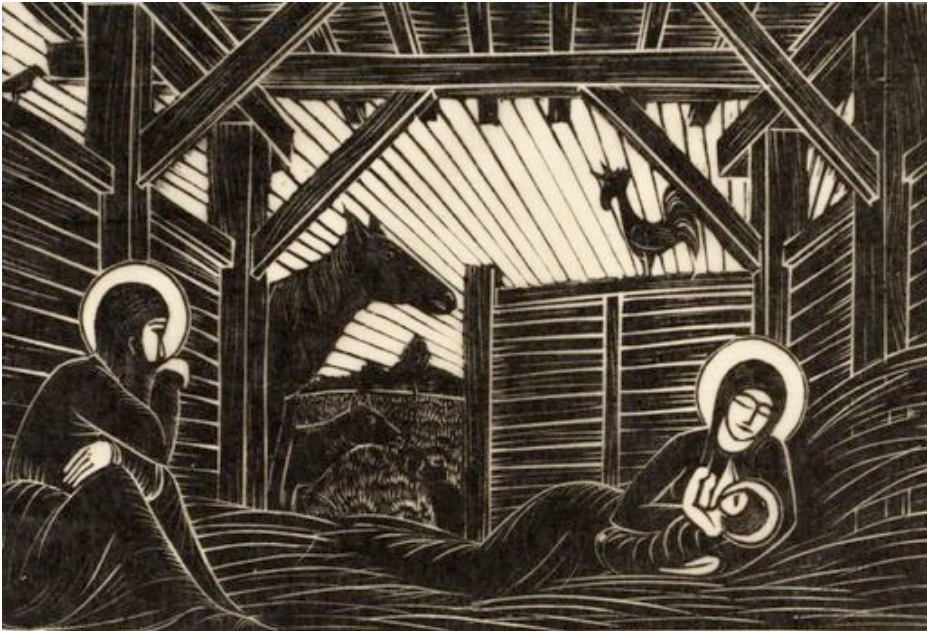
"Dawn," by Eric Gill, 1929.

∞ Keeping the heart of the University listening to the heart of God ∞