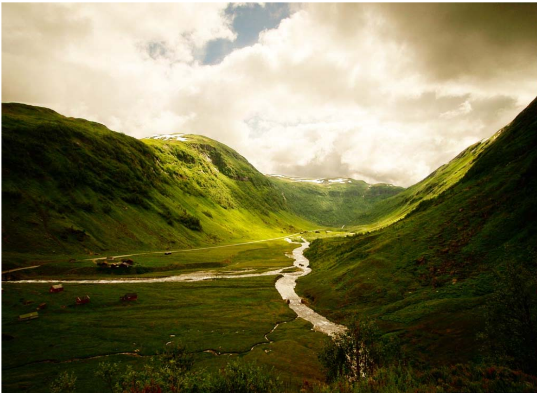
Photo of the Høla Valley in Norway, by jonr, 2007 Photo used under a creative commons license.

Keeping the heart of the University listening to the heart of God