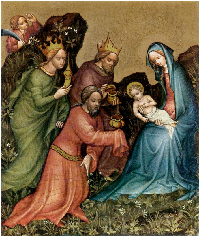
"Adoration," by a Master of the Vienna Adoration, c. 1410.

∞ Keeping the heart of the University listening to the heart of God ∞