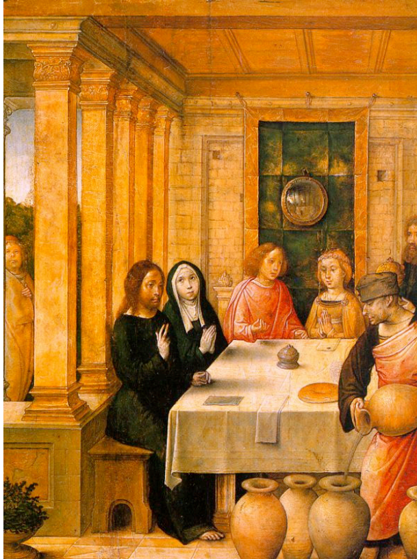
"The Marriage Feast at Cana," by Juan de Flandes, 1500.

∞ Keeping the heart of the University listening to the heart of God ∞