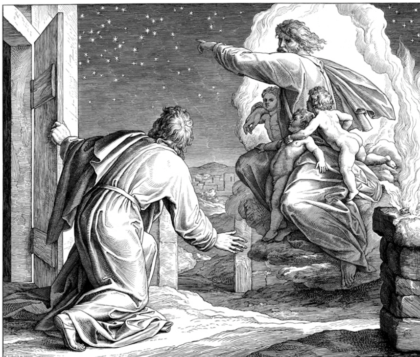
"God Shows Abram the Stars," by Julius Schnorr von Carolsfeld, c. 1850.

∞ Keeping the heart of the University listening to the heart of God ∞