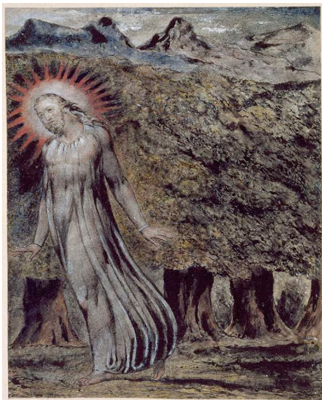
"A Prophet in the Wilderness," by William Blake, c 1820.

∞ Keeping the heart of the University listening to the heart of God ∞