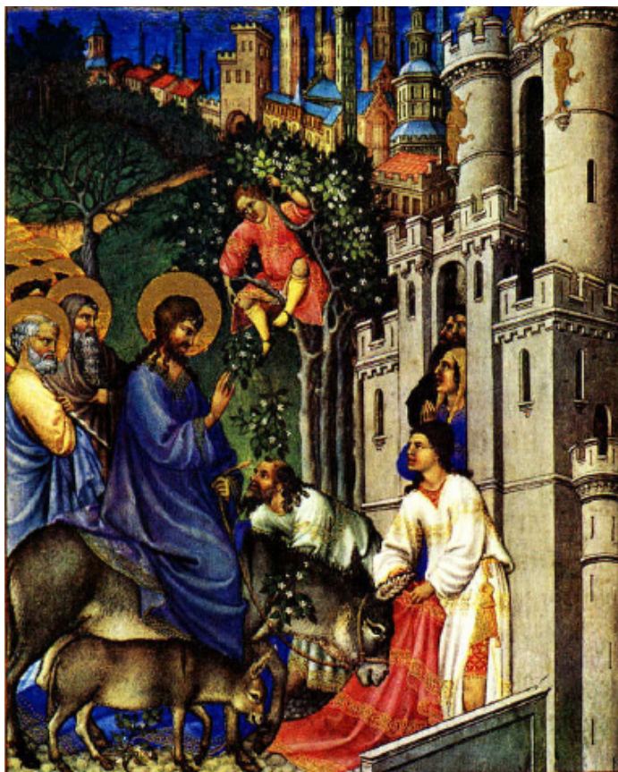
"The Entry into Jerusalem," by the Limbourg Brothers, before 1416.

∞ Keeping the heart of the University listening to the heart of God ∞