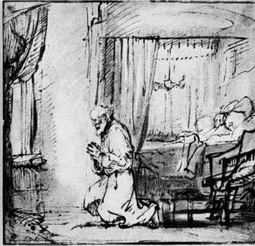
"St. Peter's prayer before the raising of Tabitha" by Rembrandt, c. 1655

≈ Keeping the heart of the University listening to the heart of God ≈