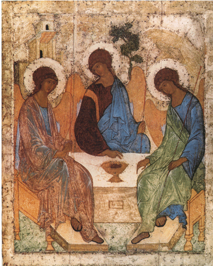
Icon of the Trinity by Andrei Rublev, 1410

∞ Keeping the heart of the University listening to the heart of God ∞