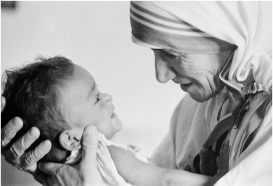
Photo of Mother Teresa and infant.

∞ Keeping the heart of the University listening to the heart of God ∞