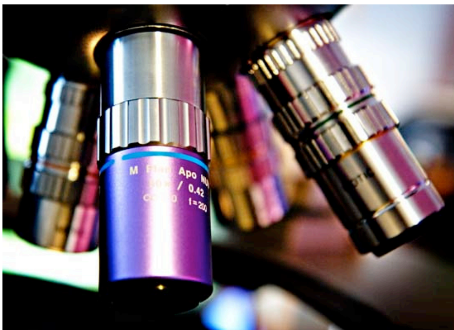
Photo of a microscope, photographer unknown

∞ Keeping the heart of the University listening to the heart of God ∞