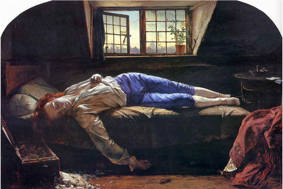
"The Death of Chatterton," by Henry Wallis, 1856.

~ Keeping the heart of the University listening to the heart of God ~