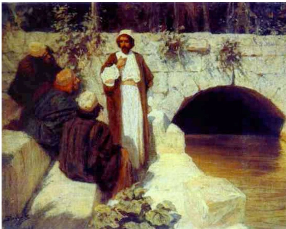
Detail of "What People Think about Me," by Vasily Polenov, 1900.

∞ Keeping the heart of the University listening to the heart of God ∞