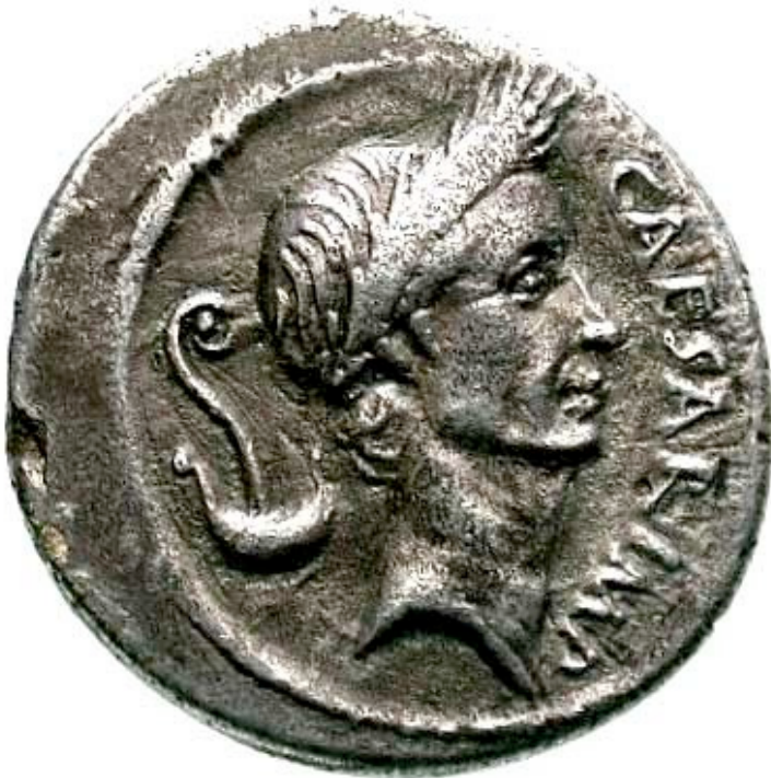
An ancient coin featuring Caesar's likeness.

∞ Keeping the heart of the University listening to the heart of God ∞