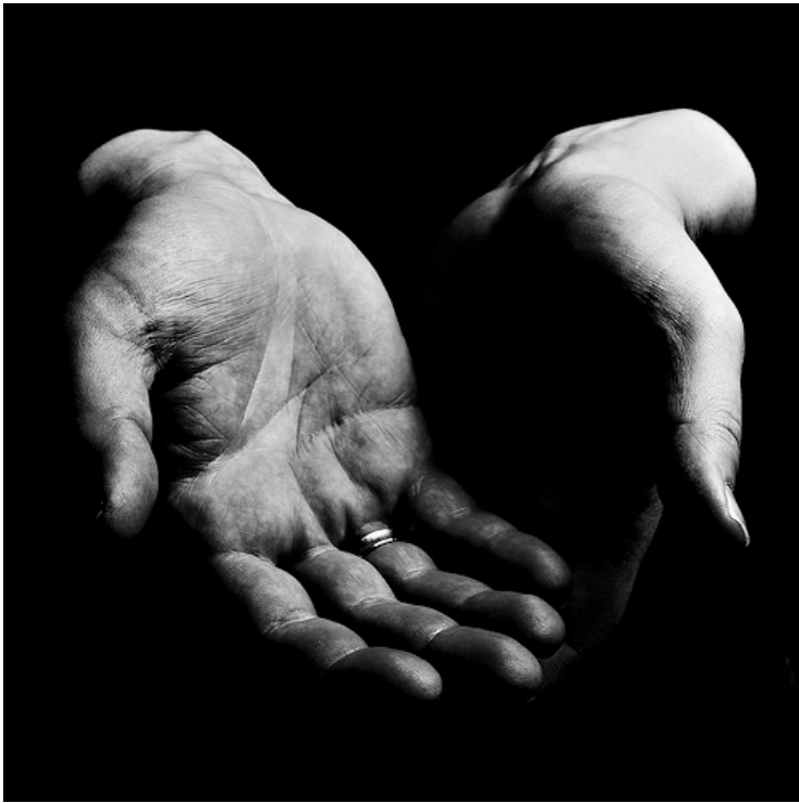
"Hands," photo by flickr user dpi96. Used with permission under a creative commons license.

∞ Keeping the heart of the University listening to the heart of God ∞