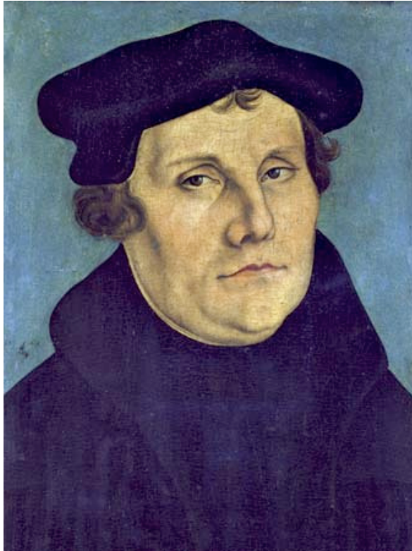
Portrait of Martin Luther by Lucas Cranach, 1529.

∞ Keeping the heart of the University listening to the heart of God ∞