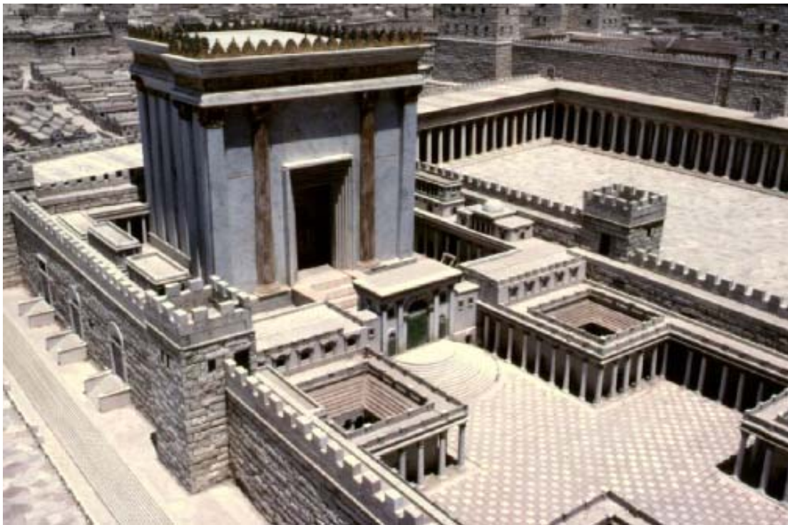
Model of the Second Temple in Jerusalem

Keeping the heart of the University listening to the heart of God