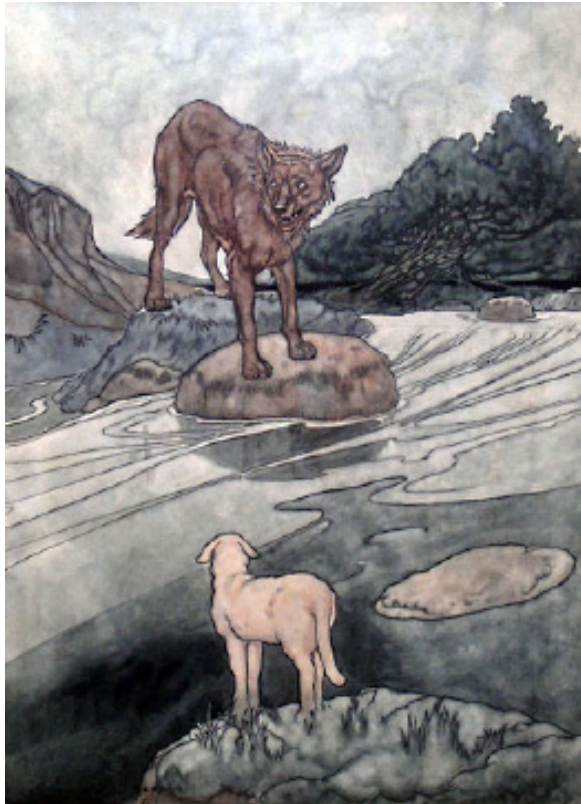
"The Wolf and the Lamb," by Charles Robinson, 1912.

∞ Keeping the heart of the University listening to the heart of God ∞