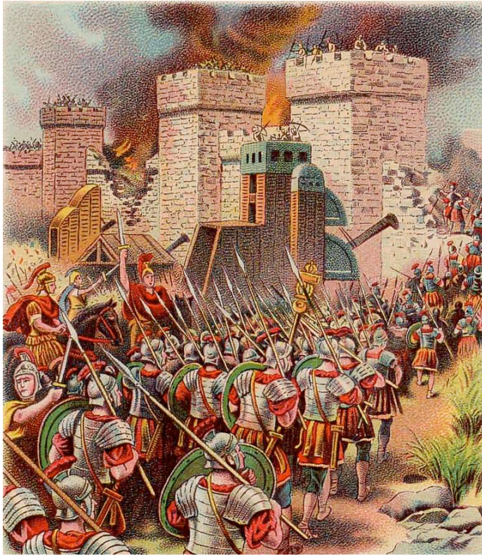
"Destruction of Jerusalem Foretold," by unknown artist. Published 1895.

∞ Keeping the heart of the University listening to the heart of God ∞