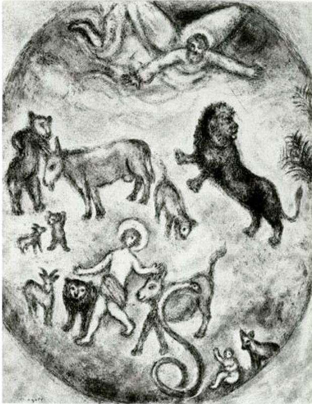
"Messianic Times," by Marc Chagall, 1952.

∞ Keeping the heart of the University listening to the heart of God ∞