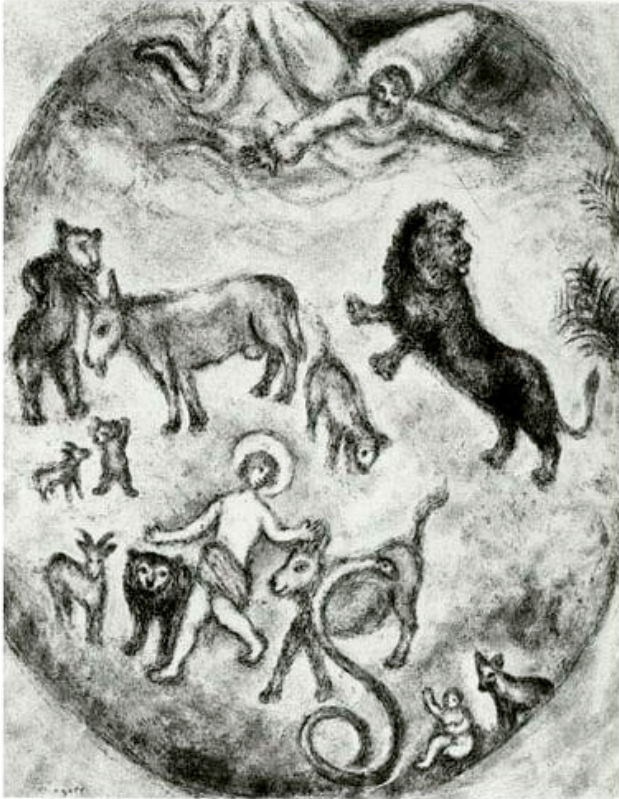
"Messianic Times," by Marc Chagall, 1952.

∞ Keeping the heart of the University listening to the heart of God ∞