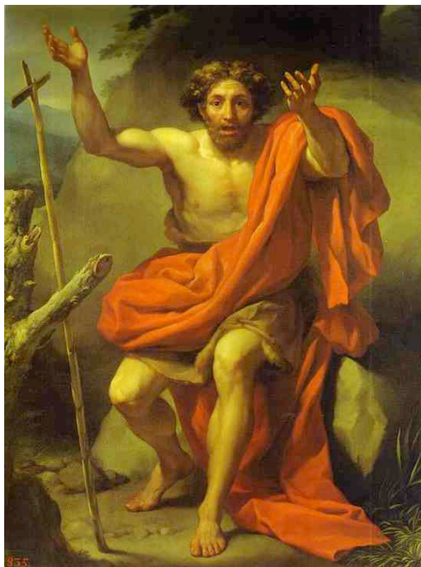
“St. John the Baptist” by Anton Raphael Mengs, c. 1774.

∞ Keeping the heart of the University listening to the heart of God ∞