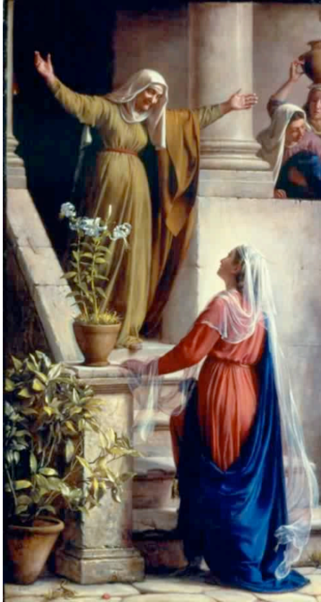
"Mary and Elizabeth," by Carl Heinrich Bloch, 1860s.

∞ Keeping the heart of the University listening to the heart of God ∞