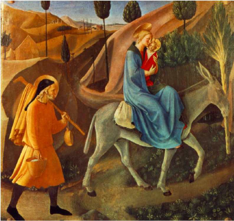
"Flight to Egypt," by Fra Angelico, c. 1450.

~ Keeping the heart of the University listening to the heart of God ~