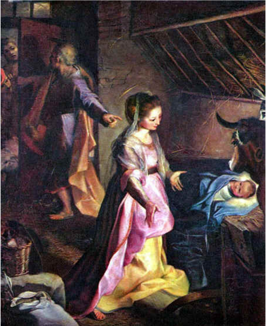
"The Nativity," by Federico Barocci, 1597.

☞ Keeping the heart of the University listening to the heart of God ☞