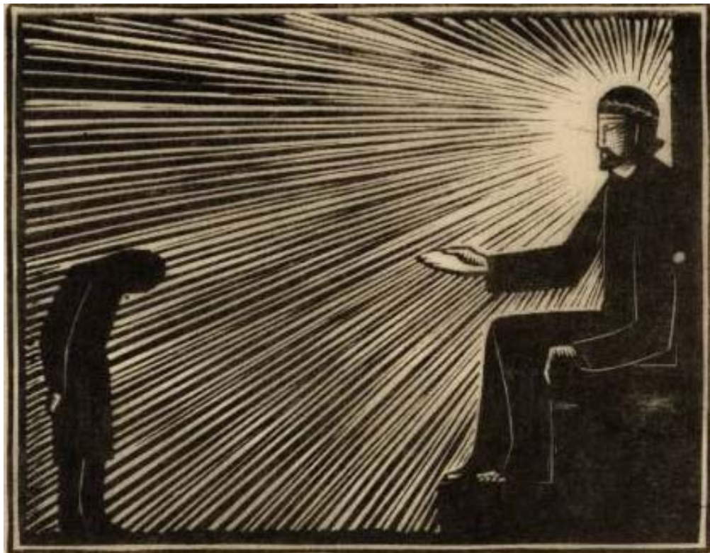
"The Last Judgment," by Eric Gill, 1917

Keeping the heart of the University listening to the heart of God