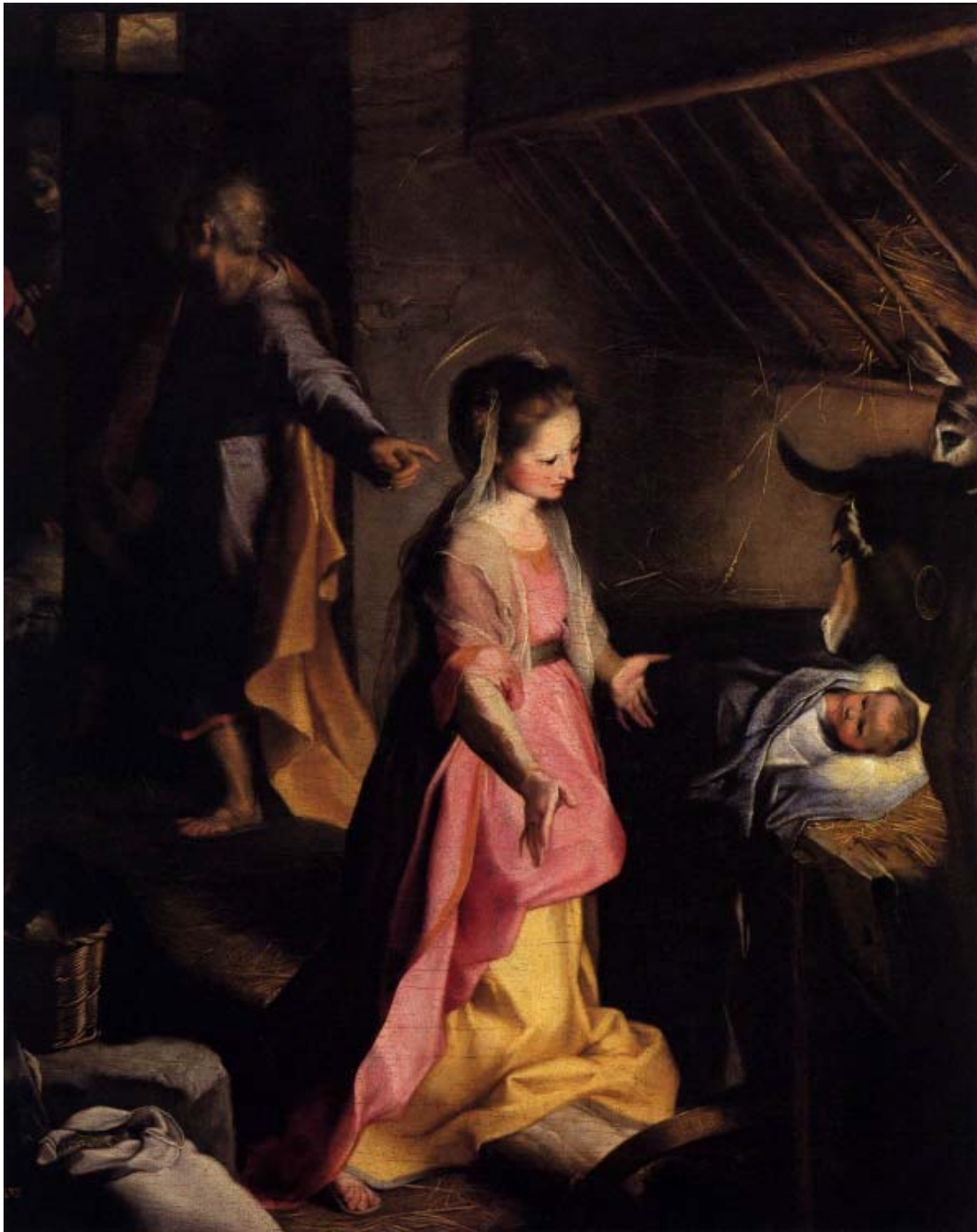
"The Nativity," by Federico Barocci, 1597

∞ Keeping the heart of the University listening to the heart of God ∞